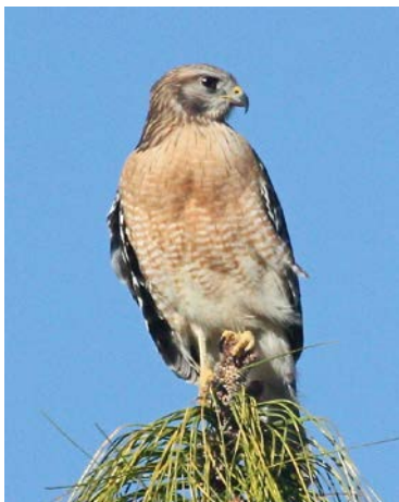
Red Tailed Hawk