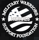
Military Warrior Support Foundation