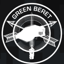
Green Beret Foundation