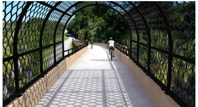
(Rendering of the 90-foot long overpass over Laurel Road)