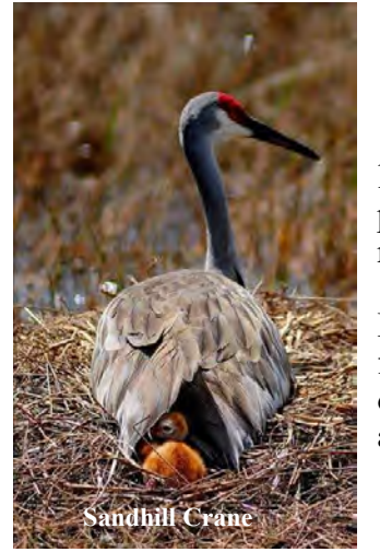
Over 35 species of birds call Palmer Ranch their home.