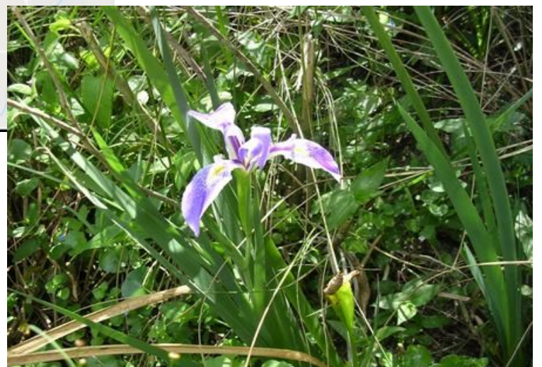
Wetlands almost always consist of beautiful flowers like this Blue Flag Iris, along with others we'll discuss in future Wetlander editions

U.S. Army Corps of Engineers (33 CFR 328.3) U.S. Environmental Protection Agency (40 CFR 230.3)