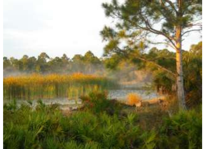
Natural Sarasota Wetlands

Stormwater runoff is created when rain lands on roofs, driveways, streets, parking lots, and other surfaces that don't absorb water. This runoff flows directly into our ponds, which are like giant bowls that keep our streets and houses from flooding.