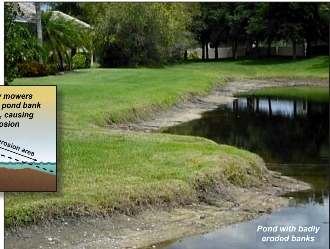
Pond with badly eroded banks