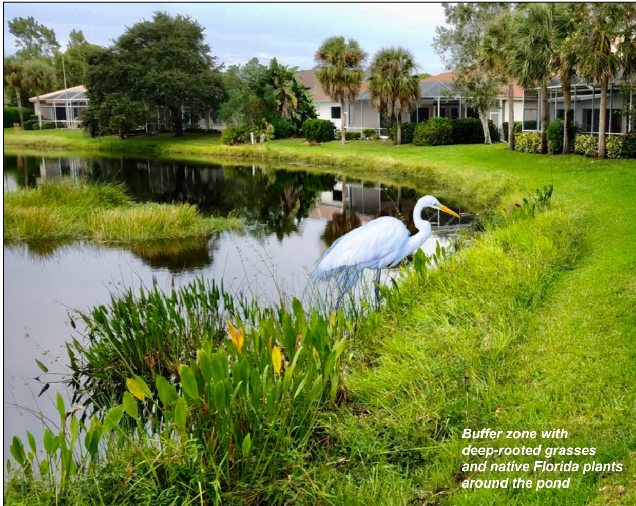
Buffer zone with deep-rooted grasses and native Florida plants around the pond