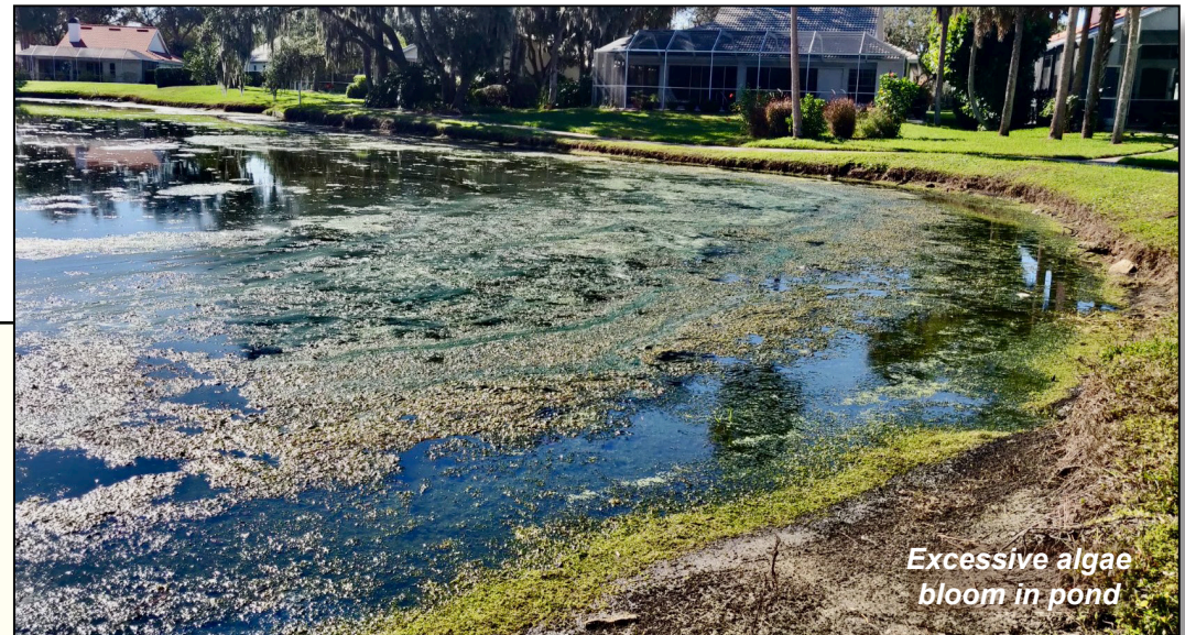
Excessive algae bloom in pond