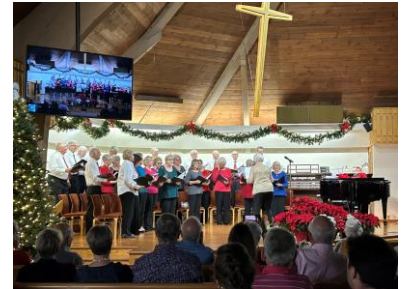
2022 Holiday Concert