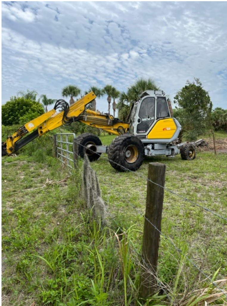
Photo of Menzi Muck, machine used to remove silt buildup within South Creek

Palmer Ranch Master Property Owners Association, Inc. recently contracted the removal of silt from the South Creek Drainage Basin, in areas owned and maintained by the Master Association. For those of you who are not aware, South Creek runs alongside the eastern border of Palmer Ranch and is a main drainage basin for all the communities from The Hampton's all the way down to the Oscar Scherer State Park. A silt removal study completed by Stantec Engineering determined that three areas of South Creek needed to be addressed. The Palmer Ranch Board of Trustees approved the expenditure and work commenced just south of Palmer Ranch Parkway Extension at Honore Avenue within Restoration Area F. From there, work continued to Restoration Area H and finally Restoration Area C.