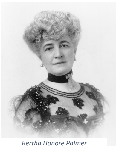
Bertha Honore Palmer

While some may think they know all there is to know about Palmer Ranch, we've hundreds of new residents on the ranch who may not be so familiar with the inner workings of the area, hence we feature this educational series every month. This month, we'll be learning the interesting history of how Palmer Ranch became to be the beautiful community we know today.