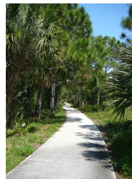
Stoneybrook Nature Trail