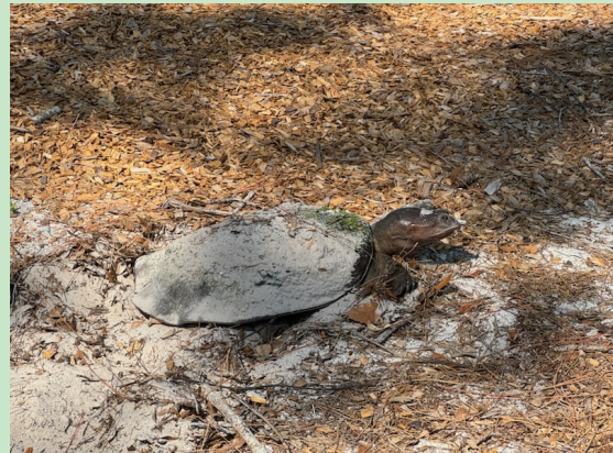
Photos of a local resident of Potter Park