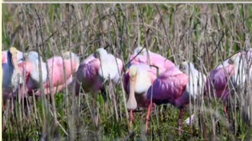
Myakka River State Park