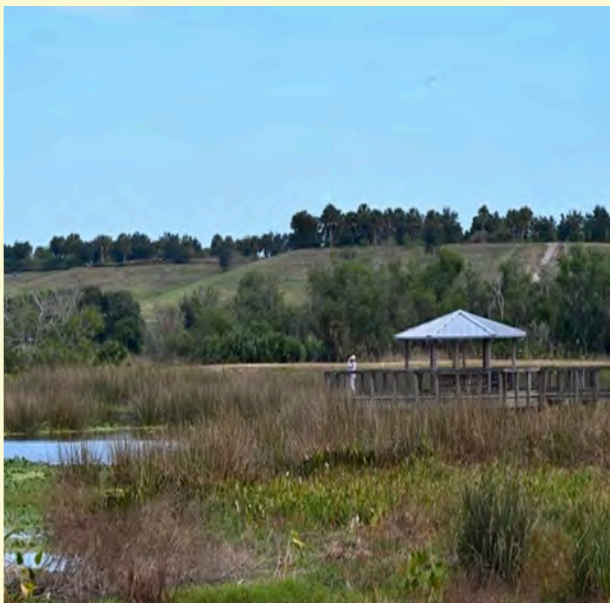
The Celery Fields