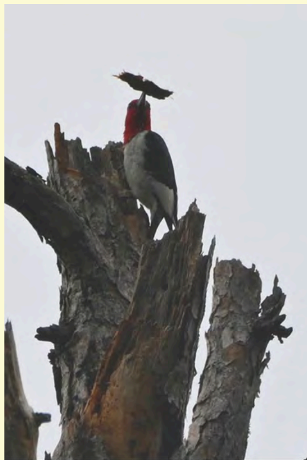
Red-headed woodpecker, Carlton

Nearly 25,000 acres of wilderness in Venice FL, the preserve boasts hiking, biking, and even horseback riding (bring your own horse!) through pine flatwoods, prairies, and wetlands.