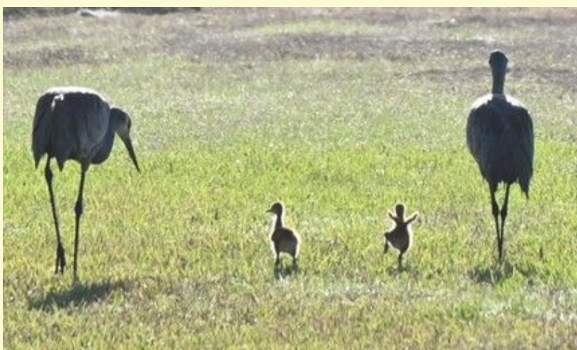
Sandhill crane family –