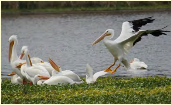
Additional White Pelican Photos taken in VillageWalk.